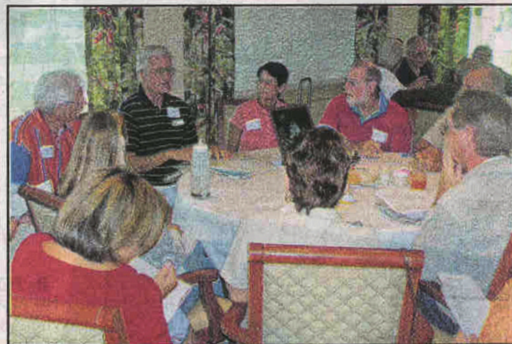
Inquiring cruisers at a Rendezvous roundtable discussion on Cruising the Bahamas.