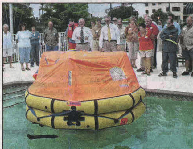
Cruisers gather to watch life raft-deployment training at the Isles Yacht Club pool during the Florida West Coast Rendezvous of the Seven Seas Cruising Association.